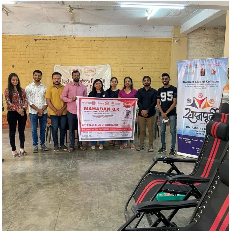
Rotaract club of Kolhapur members