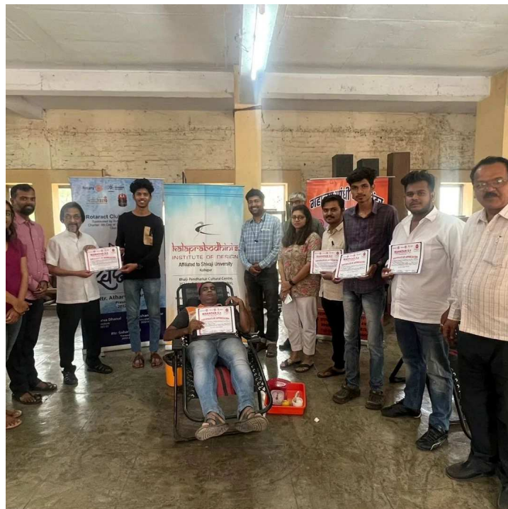
Staff blood donation and students with appreciation certificate