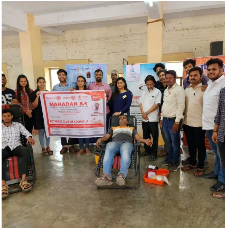
Students blood donation and with college staff